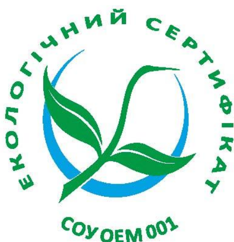
Picture 1. Ukrainian logo for eco-labelling

Certification authority body “Living Planet” is accredited under the International Coordination of Certification Systems of Environmental Labelling